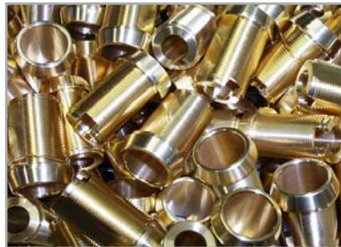
Brass screw machine parts