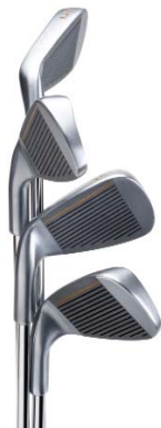
Specialty alloy castings