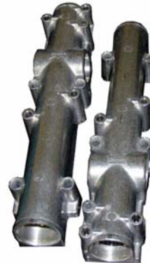
Chips and light oils on newly machined parts