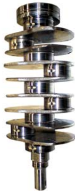
Internal engine parts